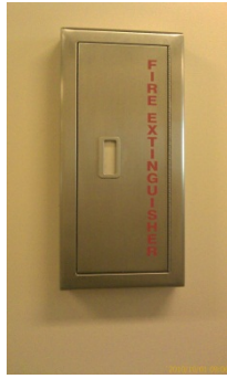
Fire Extinguisher (Two on each floor)