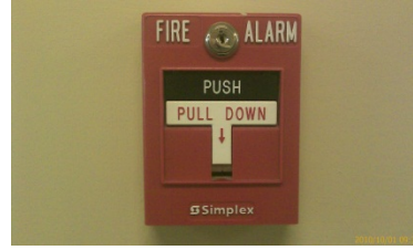
Fire Alarm Station (Three on each floor)